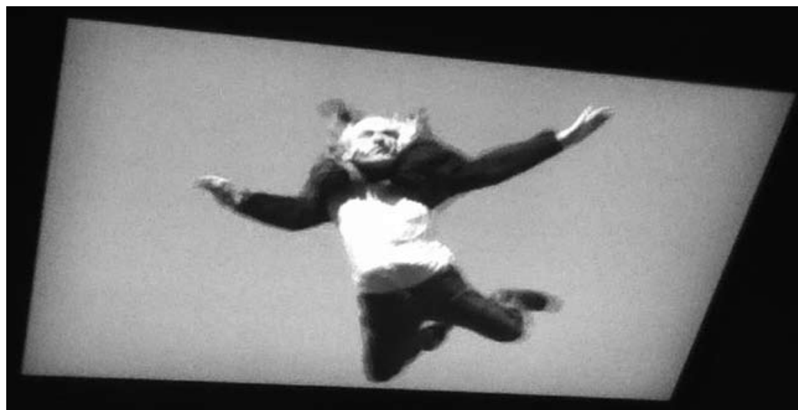
This windblown man appears to be flying across the screen

"A body is suspended in mid air. Either the person is falling,