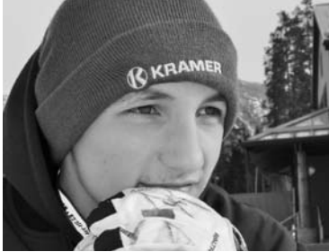
Junior Rangers in Banff 8 Two JCRs participate in ETS in Banff