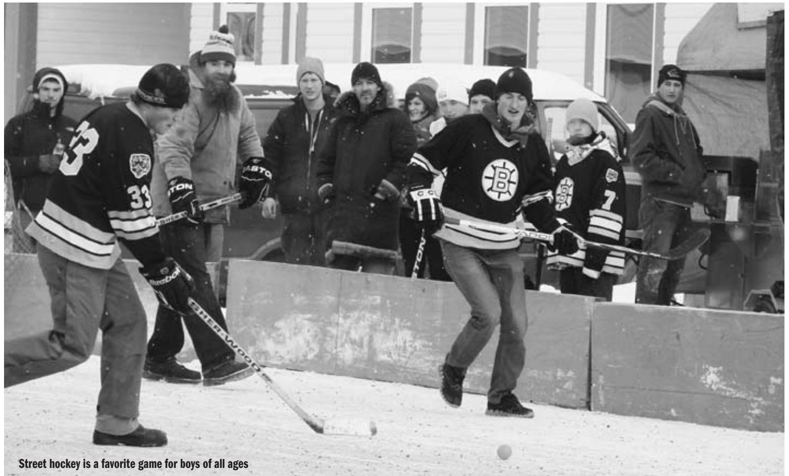
Street hockey is a favorite game for boys of all ages

It may not actually be spring yet, but Dawsonites can see it coming.