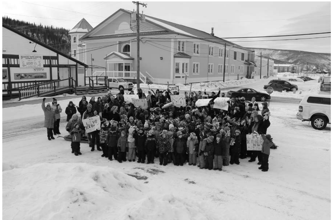
(Above) Robert Service School assembles for a day of Live Right Now activity

Guest speakers at the lunchtime launch included