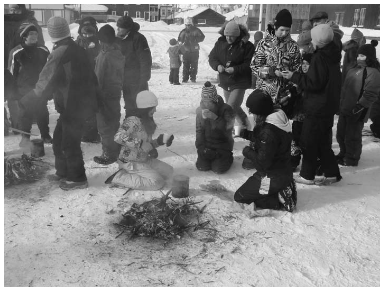
Kids work at tea boiling