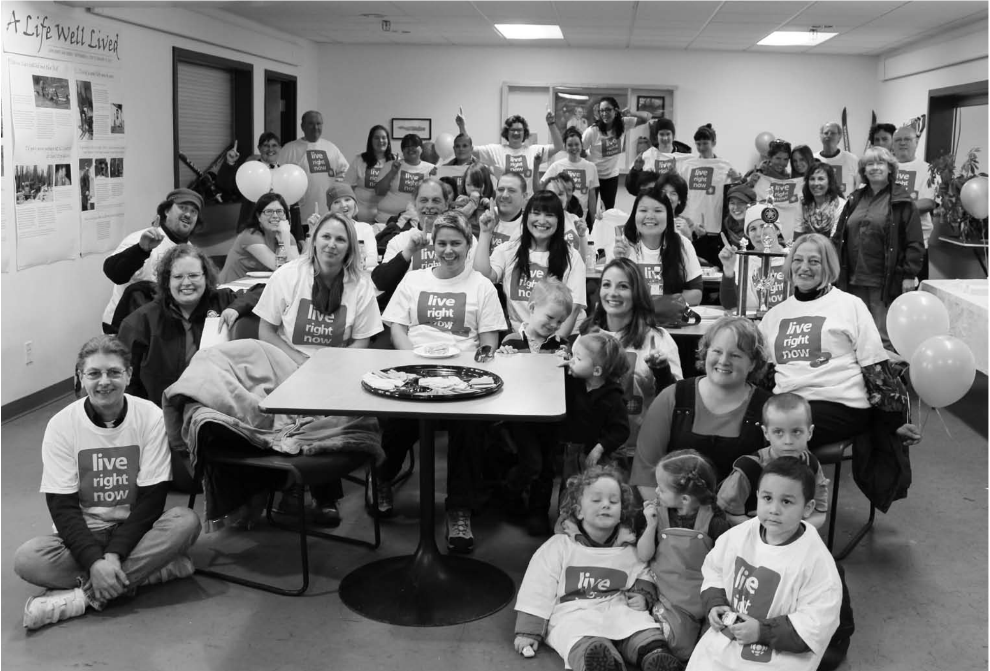
Dawsonites gather at the Recreation Centre to launch a day of events in CBC's "Live Right Now" contest. See Story on Page 3.