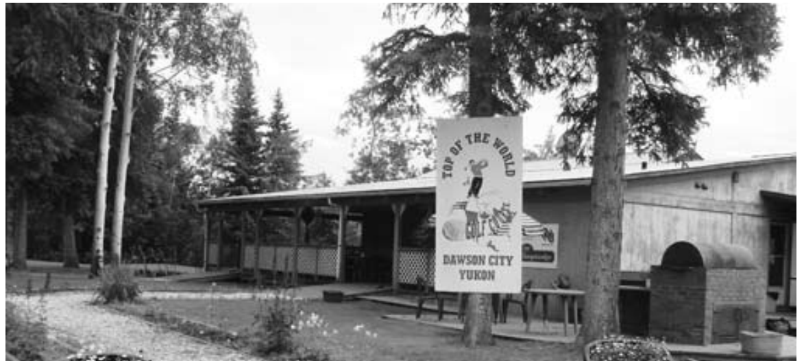
The entrance and clubhouse for the Top of the World Golf Club, seen last July

Council has stated repeatedly that it has no intention of running the golf course itself, or of having it run by the recreation department. Just what third party will step in to run the facility is not yet known, but there is a Dawson Golf Association, and it seems