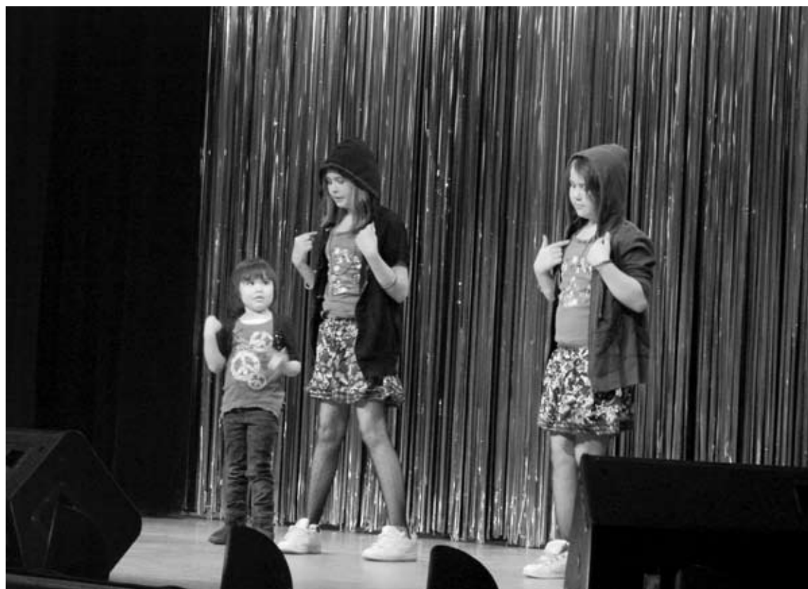
Both adults and kids love lip sync contests