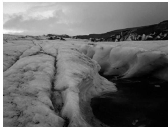
Katla on ice - Mydralsjokull

Bjork Day came. Biophillia is her new work. Beyond the stage