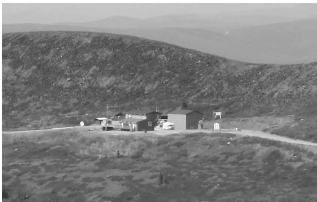
Little Gold customs station

But it's not new news. Parks announced this at the same time that they told us they were padlocking two major attractions in the territory and cutting something like 25 percent (including the entire curatorial staff) out of the