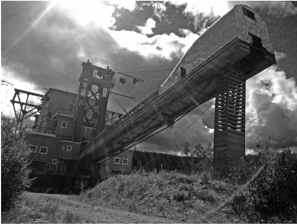
The stacker at the rear of Dredge No. 4. Such stackers created the iconic worm tail tailings piles that mark the Klondike Valley.