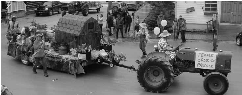
The FOOPS celebrated horticulture.