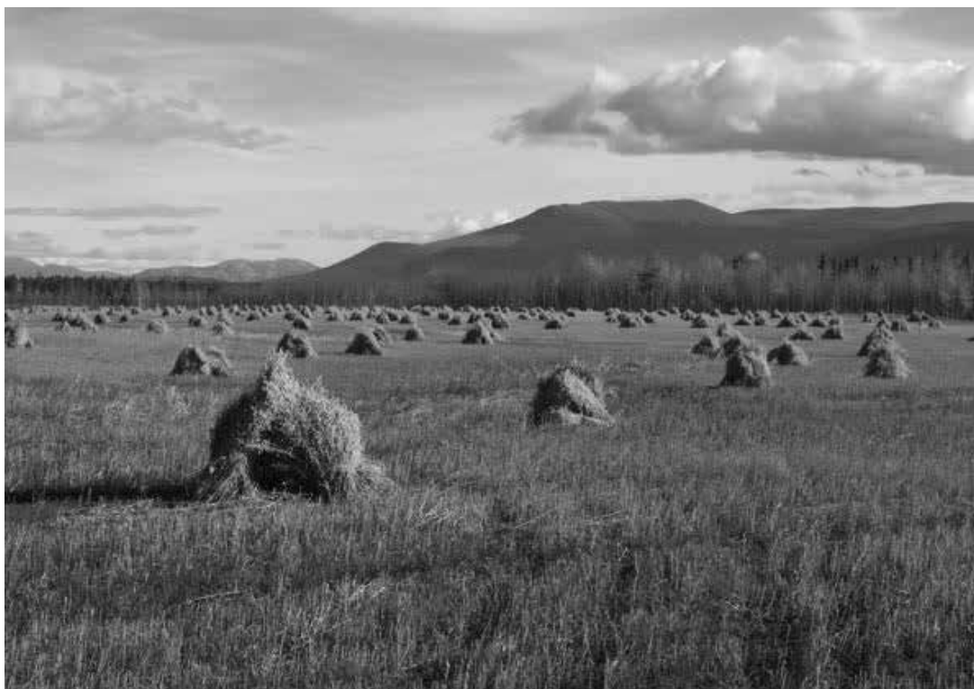
Oat bundles at Aurora Mountain Farm.

Food security, loosely defined as whether or not a region has stable access to adequate amounts of nutritious food, is measured differently between organizations. The World Health Organization (WHO) bases its evaluation on "three pillars: food availability (sufficient quantities of food available on a consistent basis), food access (having sufficient resources to obtain appropriate foods for a nutritious diet) [and] food use (appropriate