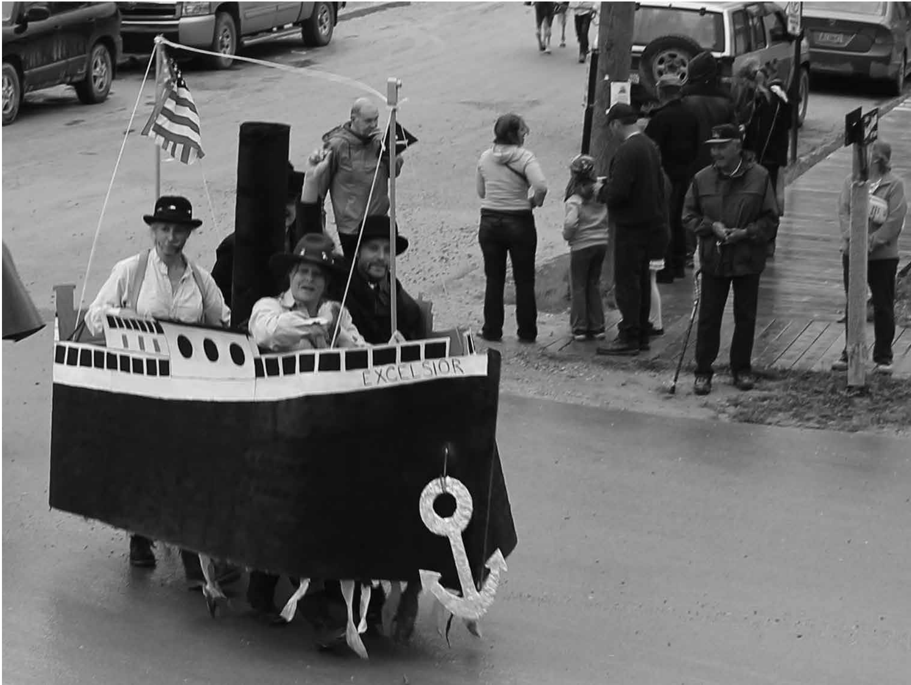
The Excelsior was the winning float under the government category. See story on page 6.