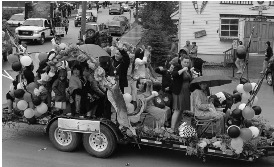
"Together today for our children tomorrow" chanted the riders on the Dänojà Zho Cultural Centre float.