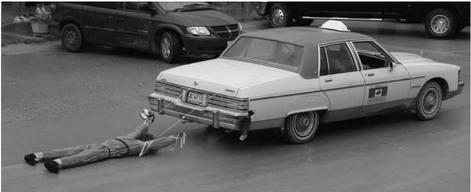
Dawson's new cab company showed how desperate some folks can be.