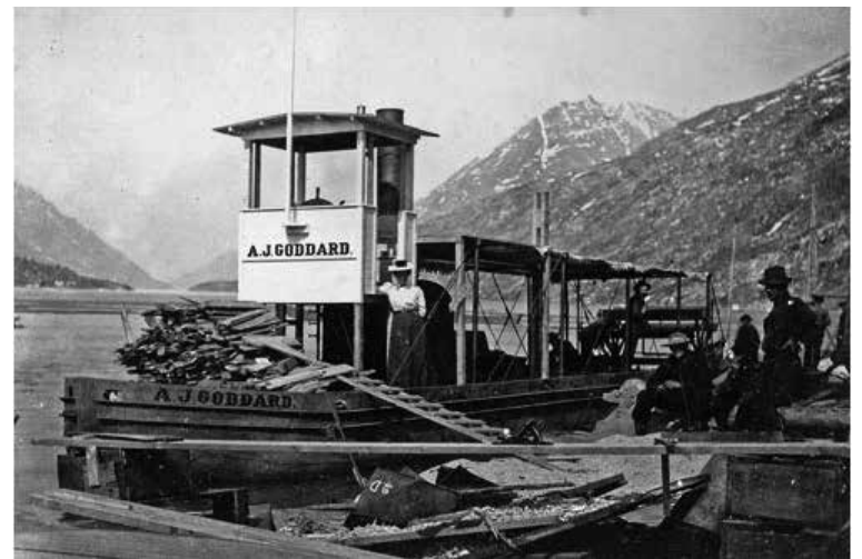
The A.J. Goddard transported goods and passengers on the Yukon River from 1898 until it sank in Lake Laberge in 1901.

For more information on the A.J. Goddard and other Yukon Historic Sites visit www.tc.gov.yk.ca .