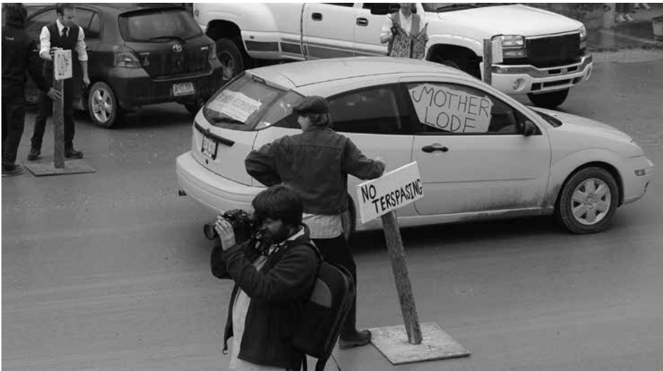
The Museum crew staked claims in search of the Motherlode.