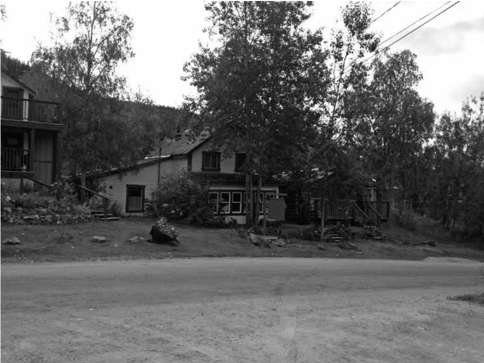
Best Business: Whitehouse Cabins