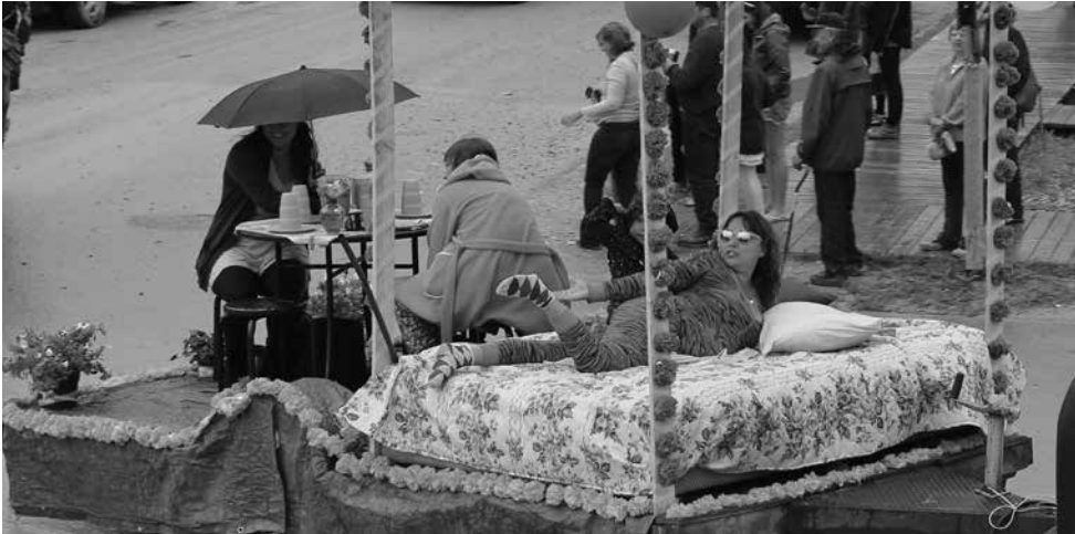
Juliette's Manor showed off its rooms.