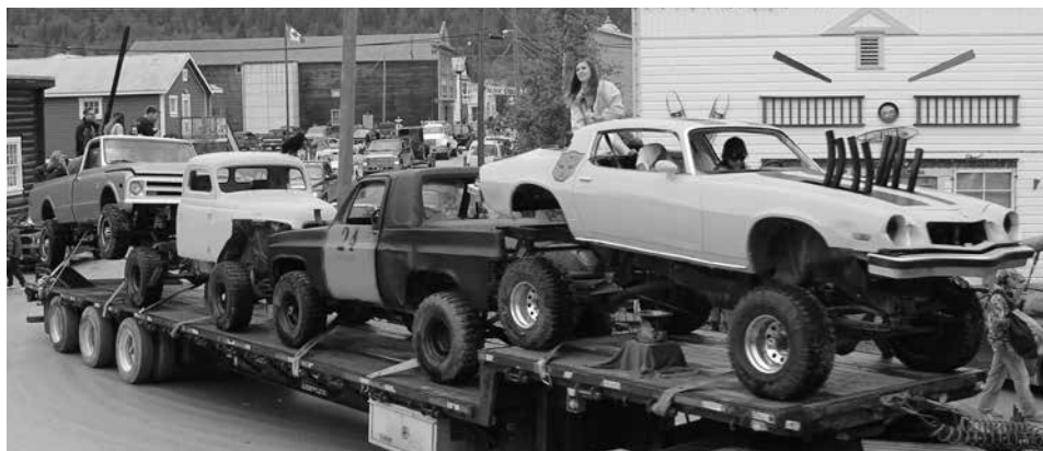
These trucks were ready for Sunday's Mud Bog.