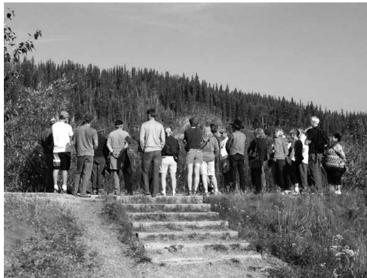
An early morning Parks Canada Tour group learns about the dike, and the history of the waterfront in Dawson.