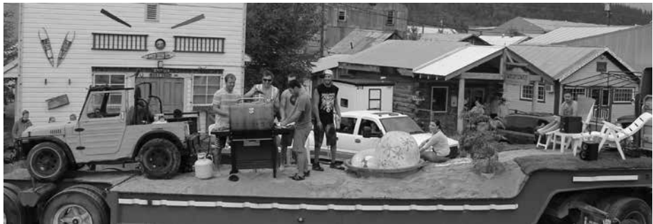
Gammie Trucking celebrated fund at the beach.