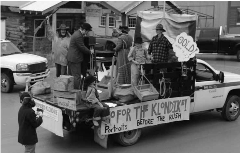
Klondike National History Sites celebrated the Gold Rush Stampede.