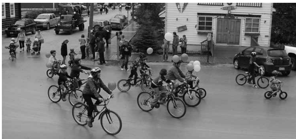
Kids always enjoy the Bike Rodeo.

Discovery Day, August 16, 1896, has different meanings for different people, depending on how it may have affected them. This was reflected in the speeches by community leaders that followed the parade on August 17 this year, just one day past the actual commemorative date.