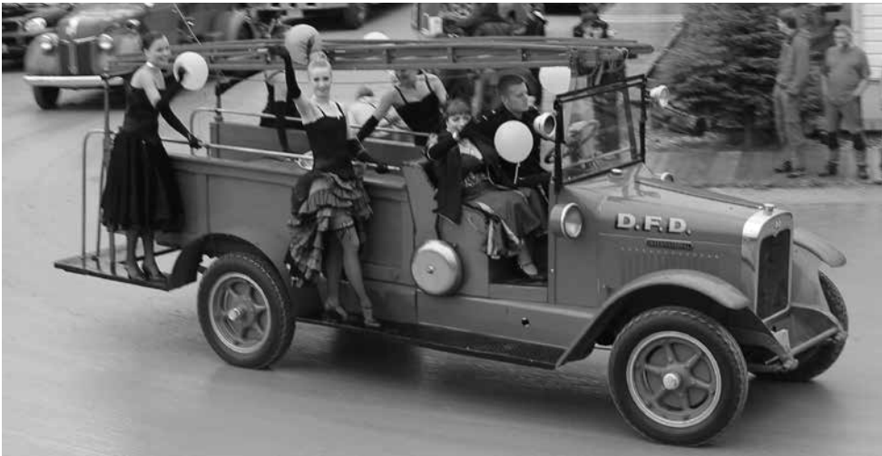
Gertie and her Girls rode Dawson's oldest fire truck.