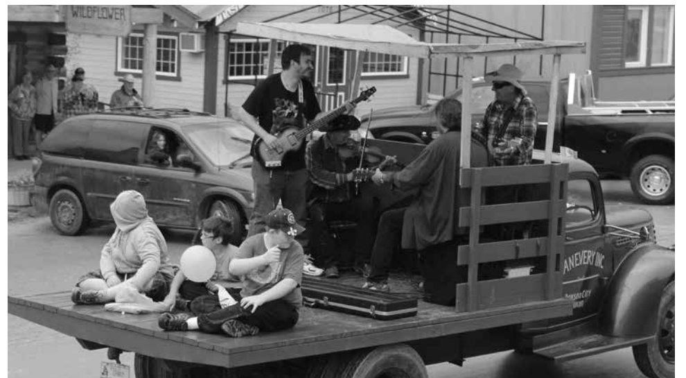
The Van Every float contained the usual band.

The weather for the weekend was variable. Friday was fine. On Saturday and rained and drizzled, but not enough to prevent major daytime events from happening. On Sunday it was fine and sunny, as was the Monday holiday.