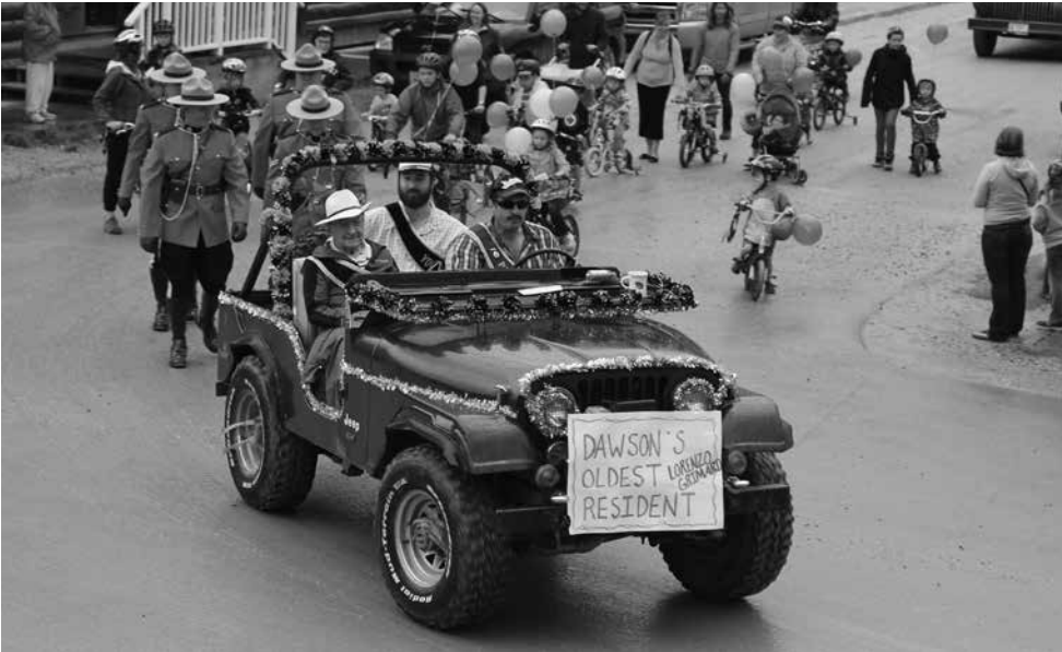
Lorenzo Grimard is Dawson's oldest citizen.