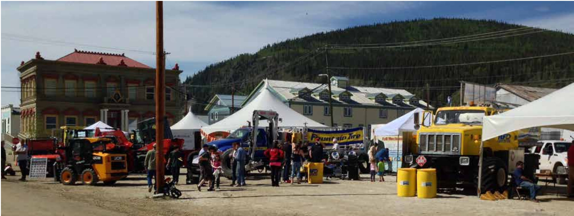
Heavy machinery and horticulture are popular venues every year.

Take in the Jack London Festival this weekend!