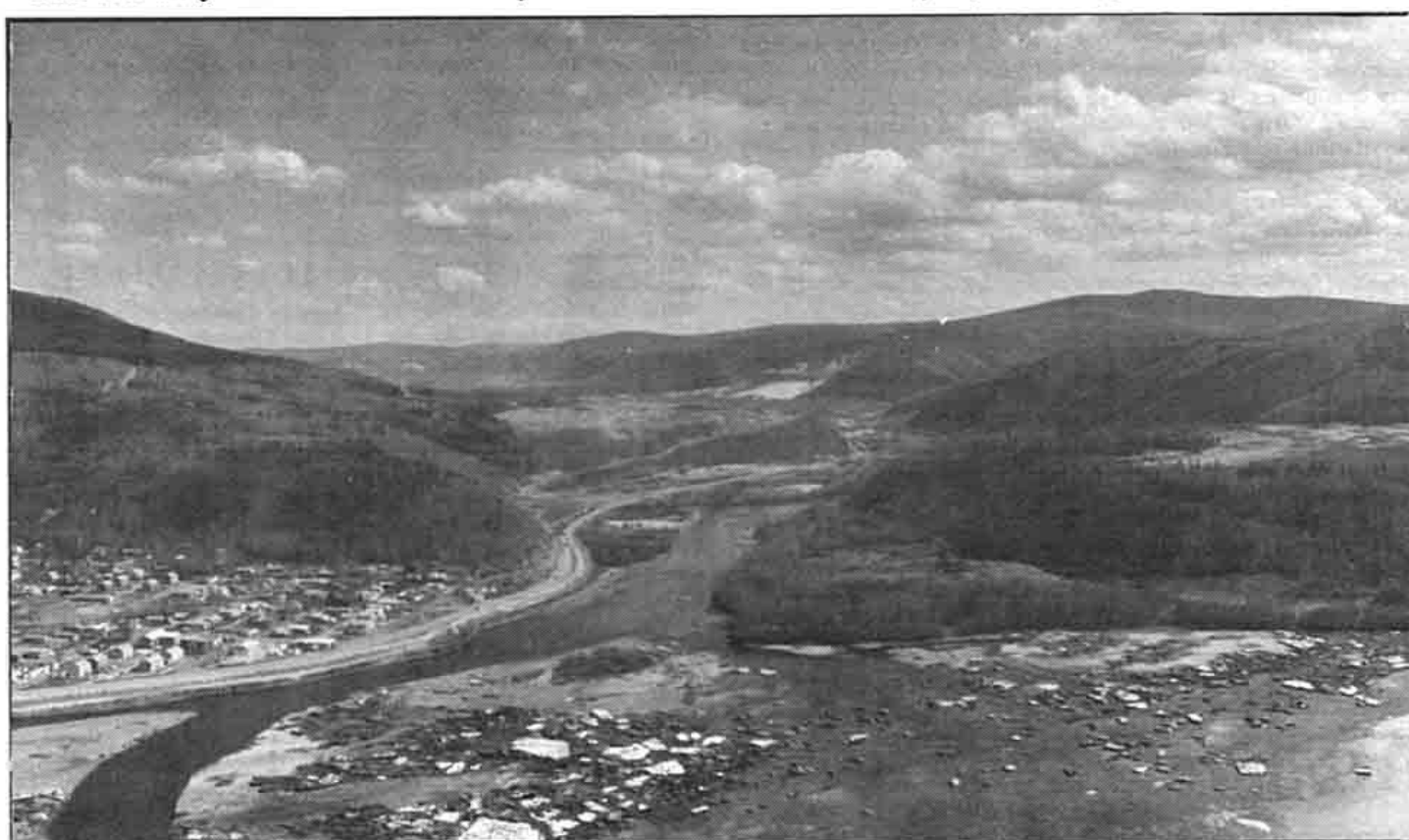
Looking up the Klondike Valley from across the Yukon River.

to make sure that the sensitive information on them doesn't fall into the wrong hands. He has been using the same card and number for the last 18 years, but feels he will now need to change it to protect himself from possible fraud.