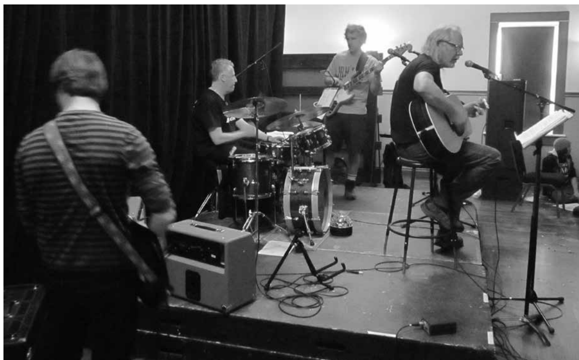
River Bends performed as both a band and as a back-up group.

flyairnorth.com 1.800.661.0407 or call your travel agent