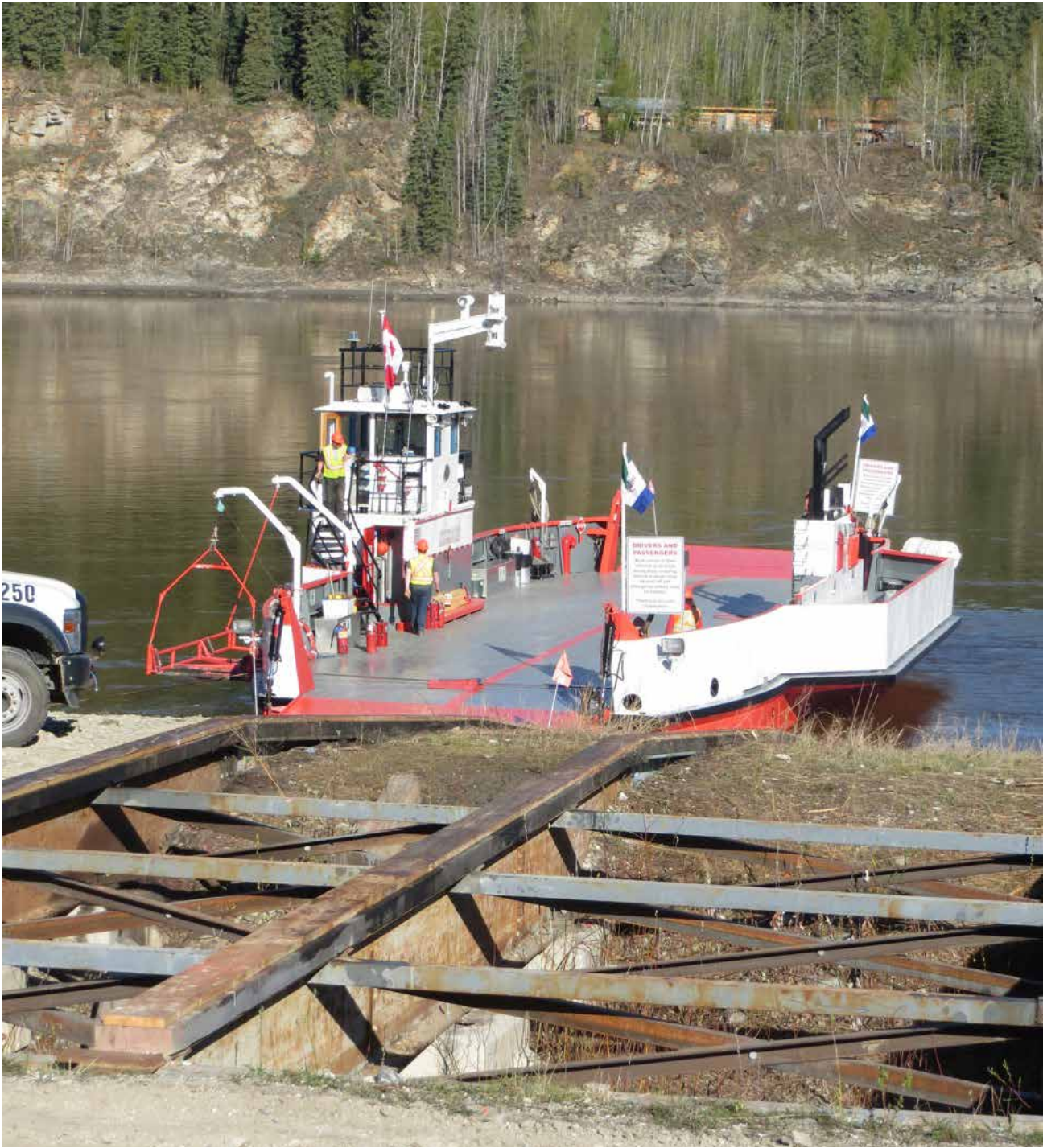
The George Black Ferry was in the water on the 12th before most of the town was awake.

We are now in some hotel rooms. What a great idea!