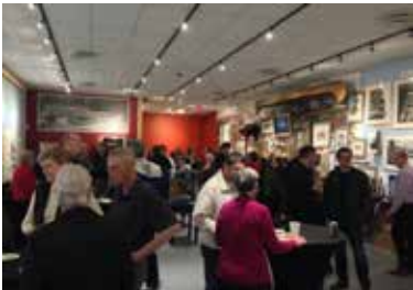
First World War and the North Last week's WWI conference dealt with history and consequences.