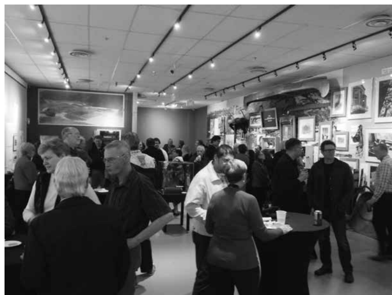
Opening reception at the McBride Museum.

The national government responded by showing that it