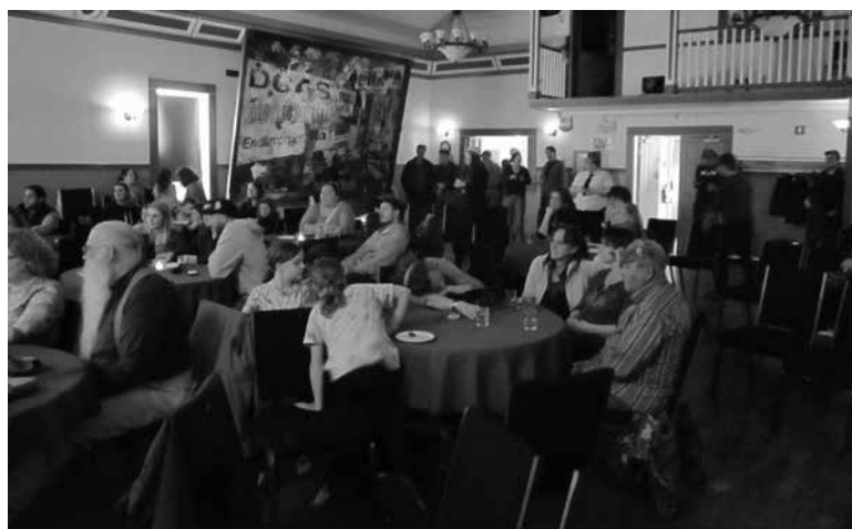
Audiences at these monthly events have been strong throughout the winter.