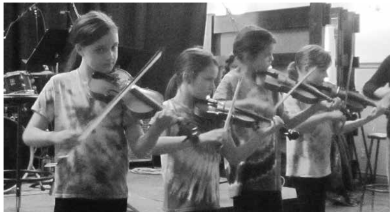
These young fiddlers have been regular performers during this year's coffee house/open mic sessions.