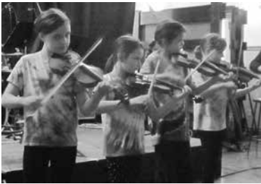
Coffee House donations to NGOs Monthly open mic Saturdays have produced good music and charity.

Klondike Constituency Yukon Party Meet the youth caucus at the 2016 Gold Show Come visit our booth.