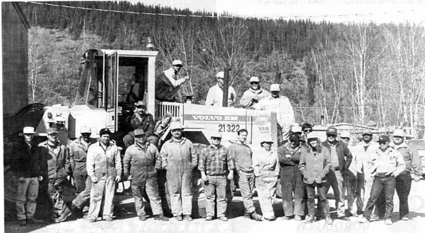
The crew from the highway compound take an uncharacteristically stationary pose next to the buidings they will soon be leaving.

Dawsonites will have to get used to not seeing those big orange trucks turning left at the end of Fifth Ave. as they head out to the highway.