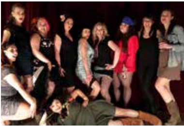
Boardwalk Empire Revue Stealing hearts during the Trek weekend.