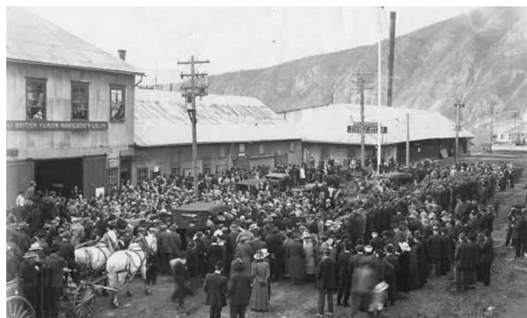
"A large crowd greeted Captain George Black, the commissioner of the Yukon, when he returned to Dawson City June 8, 1916. Recruitment of the Yukon Infantry Company had already begun; by October, 225 volunteers joined him for the long campaign overseas."

was dealt a terrible blow: the territorial bud-get was reduced and many jobs were abolished, including that of the commissioner. For all his patriotic service, Commissioner George Black, the most senior official in the Yukon, would find himself unemployed when he returned from Europe.