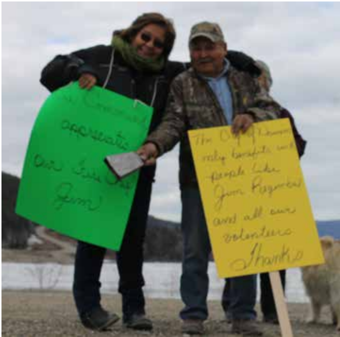
About 65 people politely demonstrated their support for the Friday evening appeal.

Our next issue will begin our 27th year.