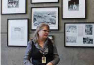
Hospital Wall Dedication Pioneer Women and Hospital History celebrated.

Our next issue will begin our 27th year.